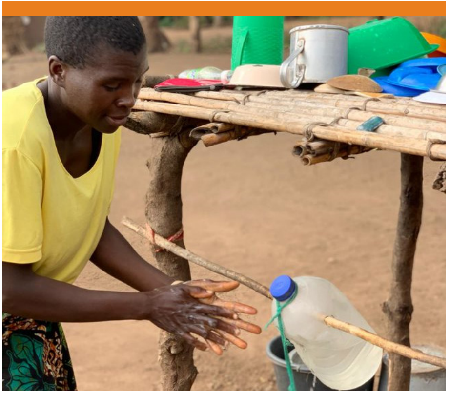
A participant in the Hygienic Family project